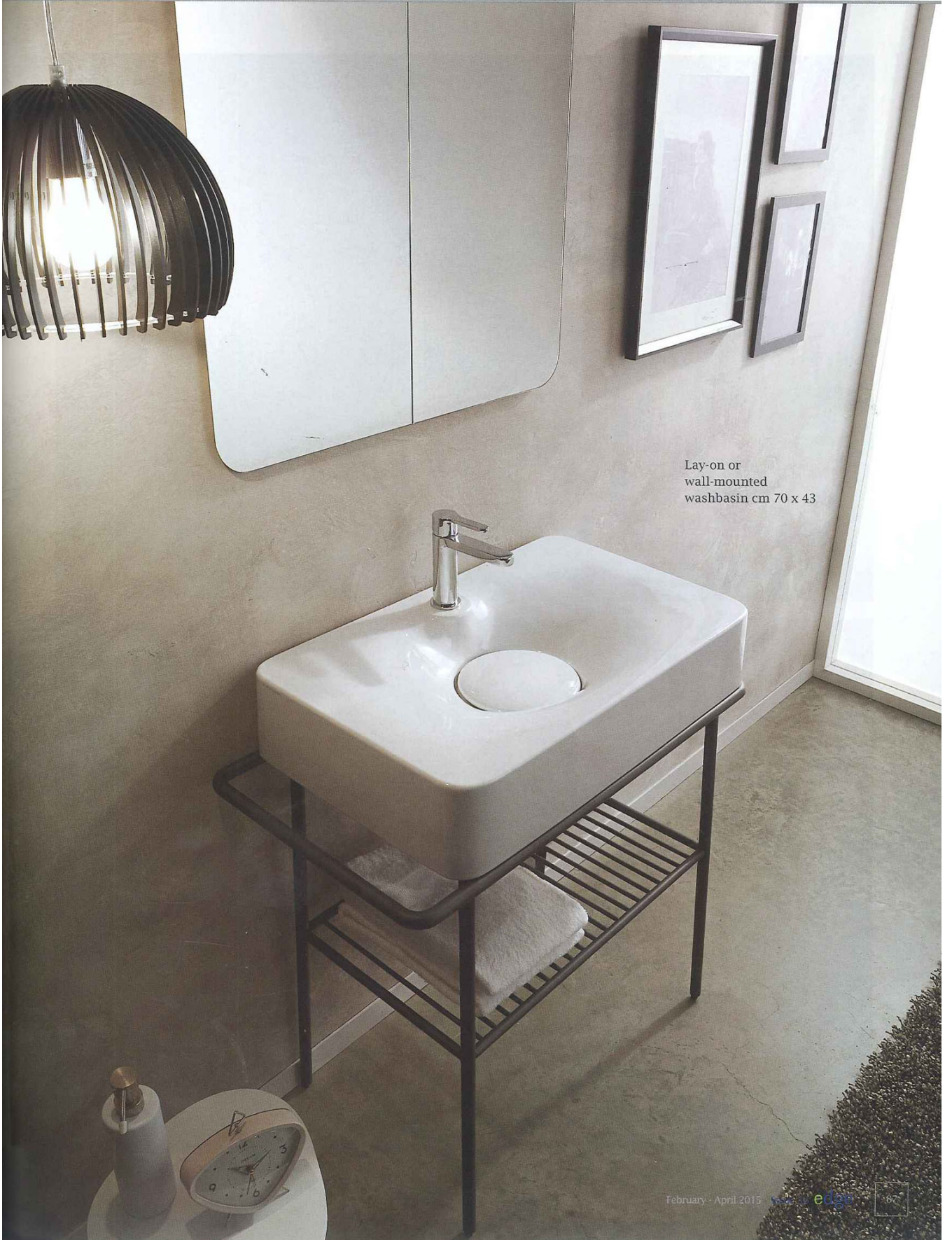
Lay-on or wall-mounted washbasin cm 70 x 43