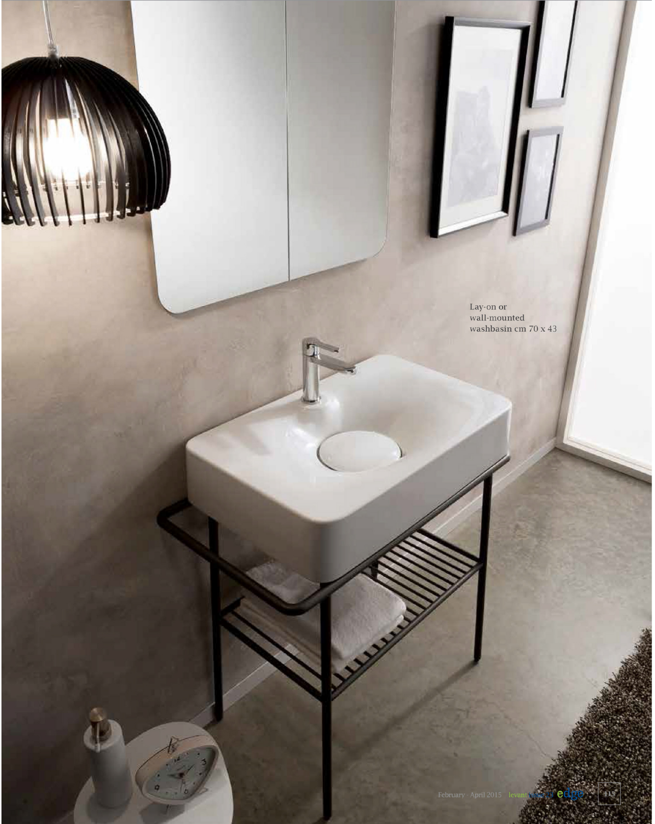
Lay-on or wall-mounted washbasin cm 70 x 43